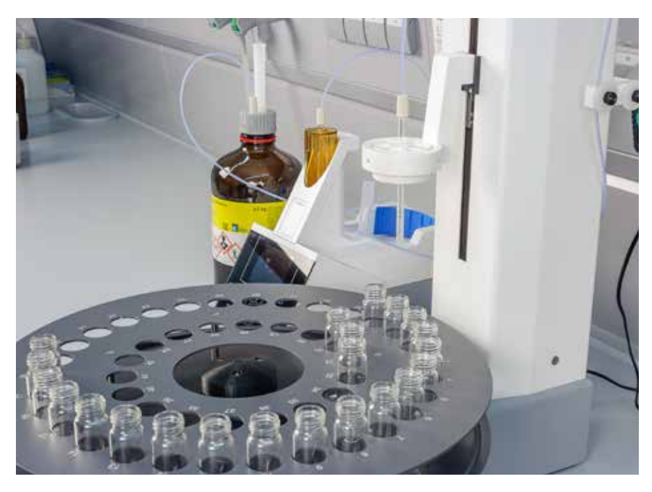
TZ 4050 sample tray for VZ 7088 laboratory bottles