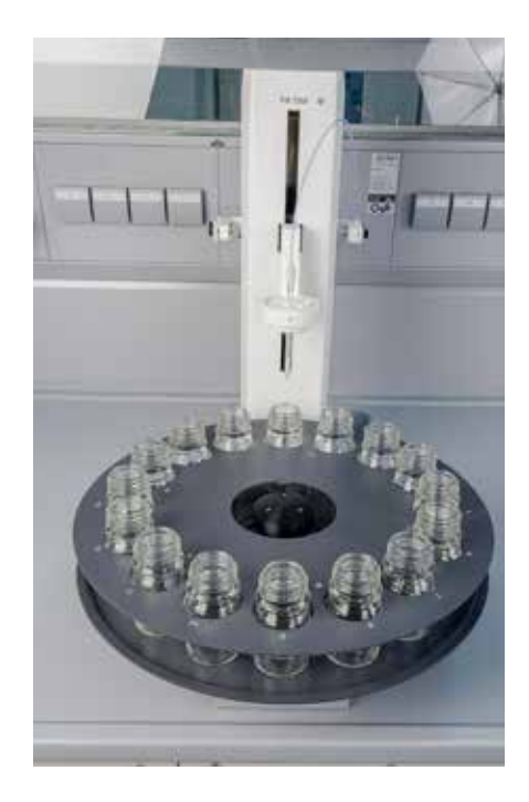
TW 7200 with TZ 4058 for VZ 7081 100 ml laboratory bottles