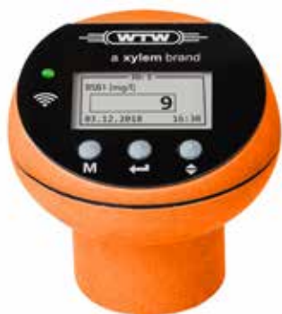
Oxitop®-IDS For all applications except biogas

The new OxiTop®-IDS is a modern measuring instrument for all kinds of respirometric studies. Regardless whether aerobic or anaerobic examinations, because of its versatility the OxiTop®-IDS is suited for both. All heads can be used independently from any meter for normal BOD measurements between one and seven days.