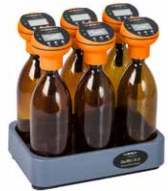
OxiTop®-IDS Set IS6

All measurements with the OxiTop®-IDS can be documented with a data acquisition program (download from www.wtw.com ) using the USB interface of the meter.