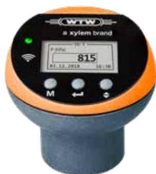
Oxitop®-IDS/B for all applications including biogas