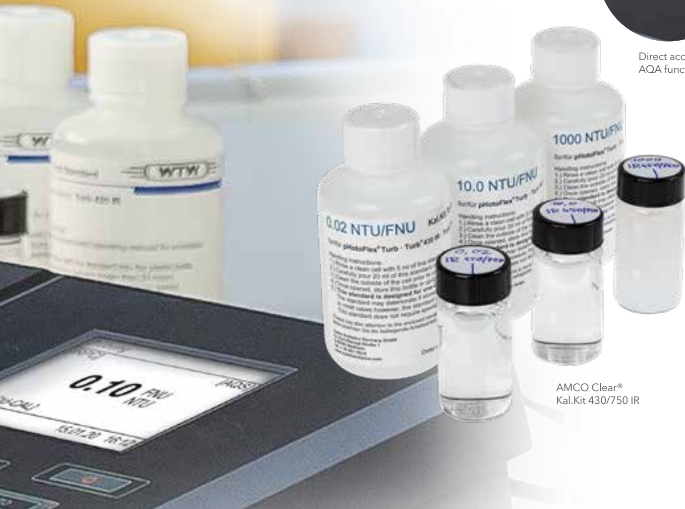
AMCO Clear® Kal.Kit 430/750 IR