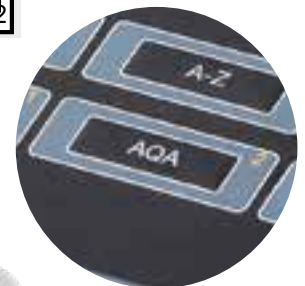
Direct access to AQA functions