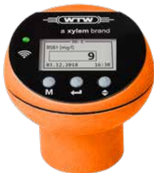
Oxitop®-IDS For all applications except biogas

The new OxiTop®-IDS is a modern measuring instrument for all kinds of respirometric studies. Regardless whether aerobic or anaerobic examinations, because of its versatility the OxiTop®-IDS is suited for both. All heads can be used independently from any meter for normal BOD measurements between one and seven days.