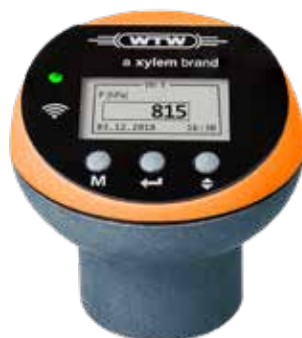
Oxitop®-IDS/B for all applications including biogas