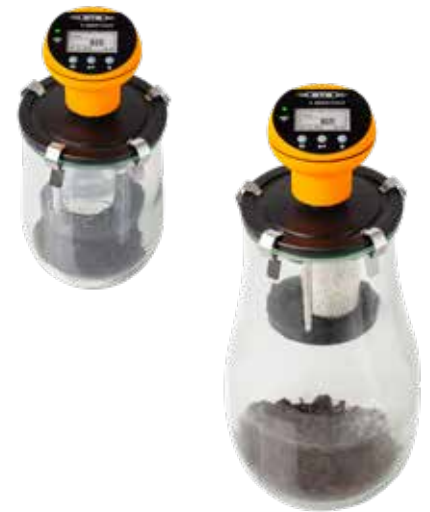
OxiTop®-IDS B6M 2.5 for AT4 tests