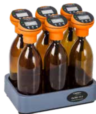
OxiTop®-IDS Set IS6

All measurements with the OxiTop®-IDS can be documented with a data acquisition program (download from www.wtw.com ) using the USB interface of the meter.