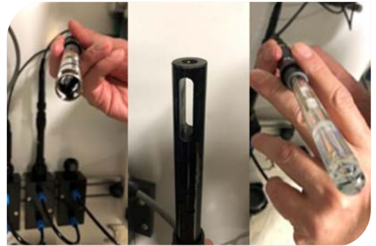
Fig. 3: Sensors after five months of operation (Left: oxygen sensor, center: conductivity sensor, right: pH sensor)