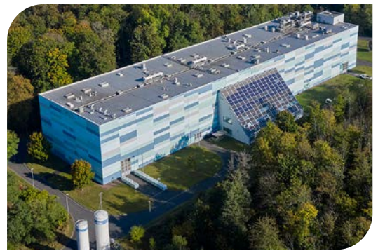
Fig. 1: The Aschaffenburg water treatment plant

A detailed process diagram (only in German) can be found on the operator's website.