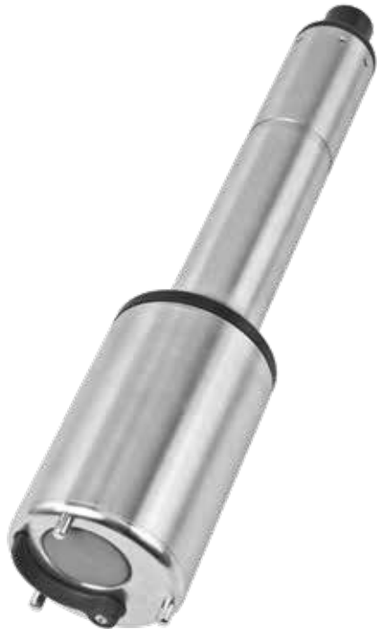
Digital ultrasonic sensor IFL 700 IQ