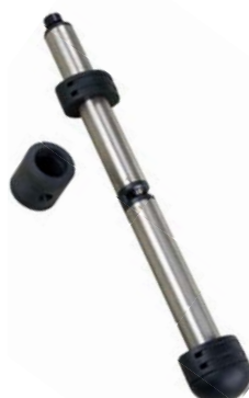
Spectral sensor with multifunctional slide and Shock-Absorption-Rings

High-tech materials such as titanium and peek ensure an easy use in almost all and even corrosive media.