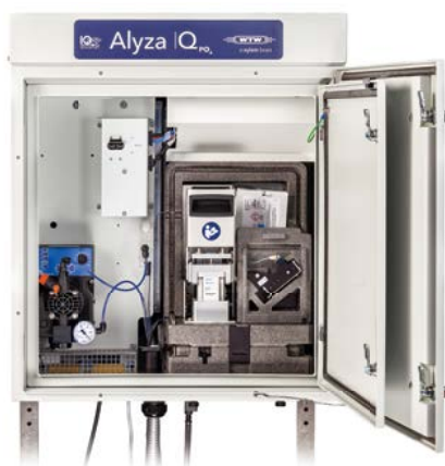
Alyza IQ PO 4 one channel version with open measuring unit and visible photometer