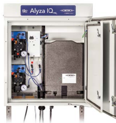
Alyza IQ PO 4 two channel version with covered measuring unit