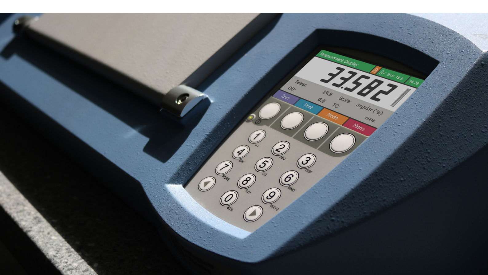
ADP400 Series Measurement Display for Specific Rotation